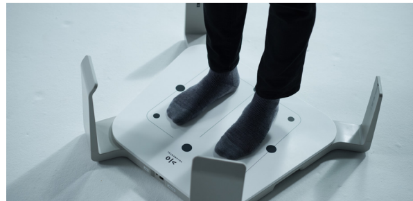
Scan / A 3D scanner captures 16 key foot measurements, and a pressure plate visualizes gait and pressure points.