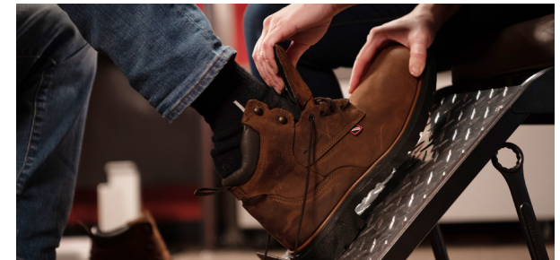
Fit / Customized technology creates a 3D model of their feet. AI-driven results match an ideal fit within your company-approved footwear styles along with insoles, socks and aftercare products for the support and comfort they deserve – all day, every day.