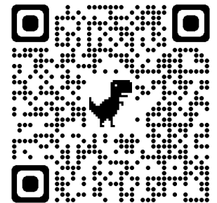
For more Licensure exam information, scan me!